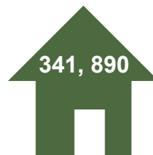
Iowans struggle with food insecurity