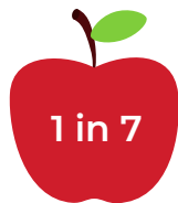
Iowa children do not have enough to eat