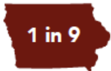
Iowans are food insecure